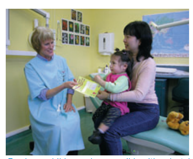
Enrol your child as early as possible with a dental therapist, eg, at 12-15 months old. Ask your preschool or WellChild nurse for enrolment forms.