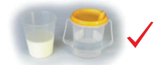
Use a cup for drinks rather than a bottle. Offer only milk or water.