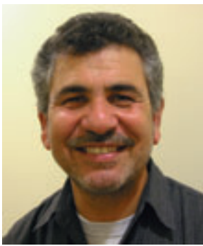
Healthy teeth will last a lifetime.