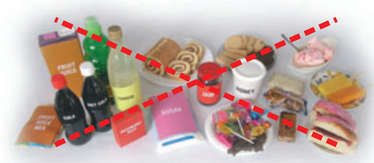
These foods and drinks can harm teeth.